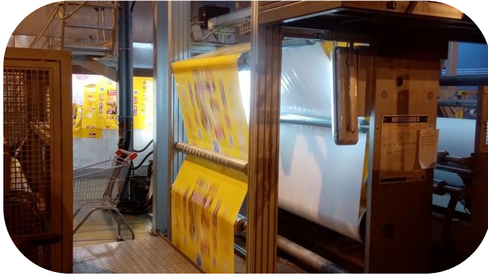
Petropack prints now with 5, 6 or 7 spot colors in the same artwork

In Argentina, the company is already the market leader, but now, with a consistent quality strategy - supported by Siegwerk PMC team - it is in a position to take on the competition in neighboring countries. And they don't intend to stop at 7-color ECG.