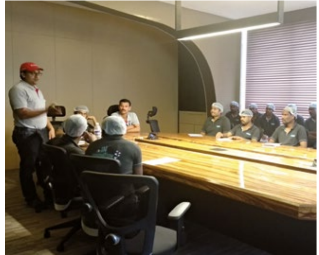
Siegwerk training session with Parakh Flexipacks staff

retention area and safety controls match world class standards," Nalawade concluded.