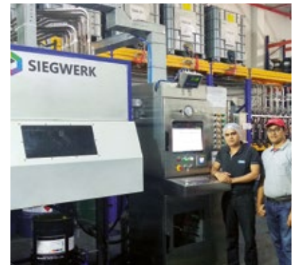
The new automated ink dispensing system reduces ink dispensing time by 68 percent.

To drive this concept further towards continuous improvement, Siegwerk will conduct a Process Management & Consulting (PMC) audit to define additional print process improvements.