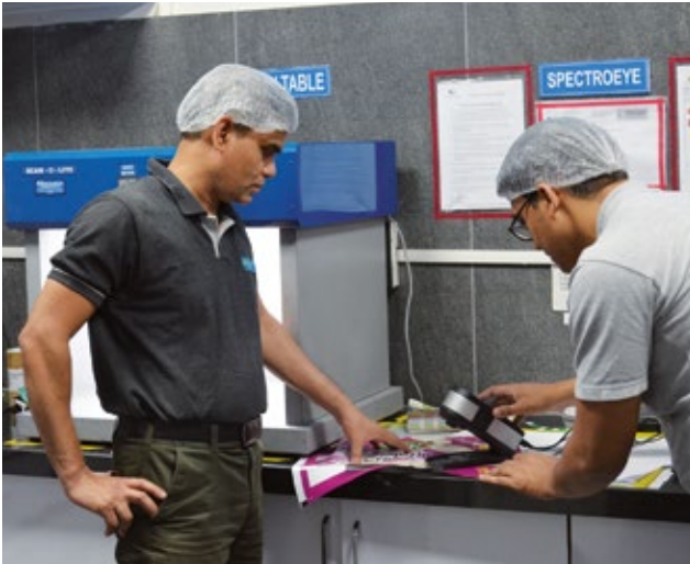
The new high-standard ink laboratory