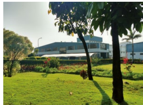
Exterior view of the plant